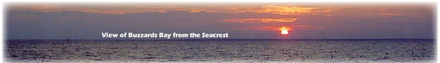
View of Buzzards Bay from the Seacrest